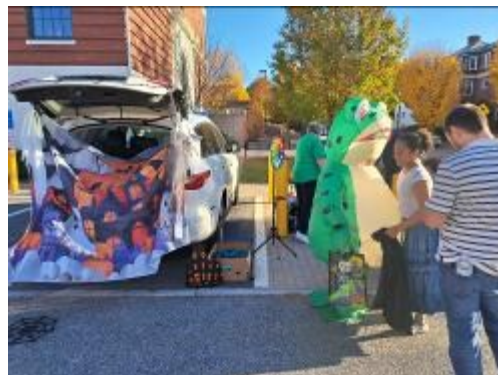
Our great volunteers!