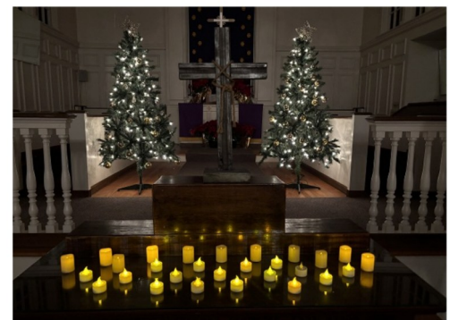
Blue Christmas Service