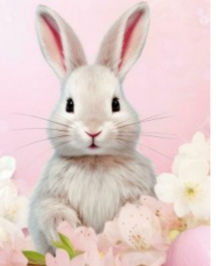
Photo Op with the Easter Bunny Easter Egg Hunt, Treat Bags for All Prize Wheel, Cookie Decorating and Crafts

"Here is my servant! I have made him strong. He is my chosen one; I am pleased with him. I have given him my Spirit, and he will bring justice to the nations. He won't shout or yell or call out in the streets. He won't break off a bent reed or put out a dying flame, but he will make sure that justice is done. He won't quit or give up until he brings justice everywhere on earth, and people in foreign nations long for his teaching."